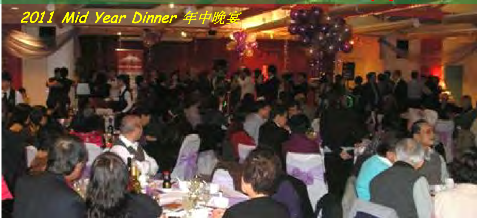
2011 Mid Year Dinner 年中晚宴